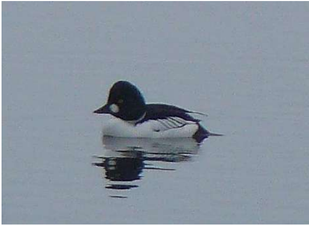
Fig. 4. Bucephala clangula (L) (like Yordans'ke)