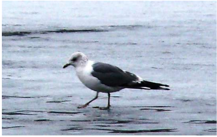
Fig. 5. Larus canus (L) (like Yordans'ke)

The Mammalia is represented by two species, in particular Ondatra zibethicus (L) and Castor fiber (L) (Berne Convention). C. fiber (L) was recorded from two lower lakes: Kyrylivs'ke and Yordans'ke, while muskrat was found in all the studied water bodies.