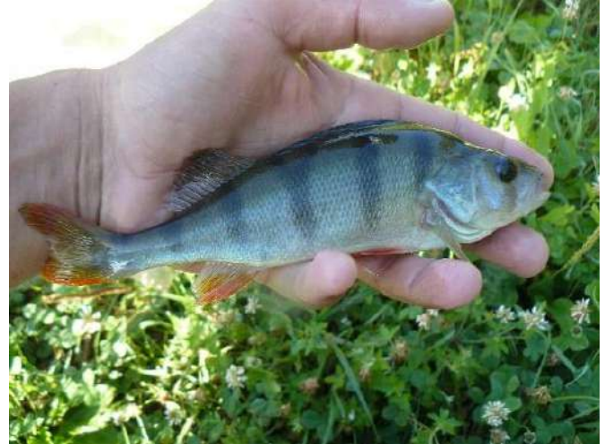
Fig. 2. Babka gymnotrachelus (K) caught on the lake Kyrylivs'ke Fig. 3. Perca fluviatilis (L) caught on the lake Kyrylivs'ke