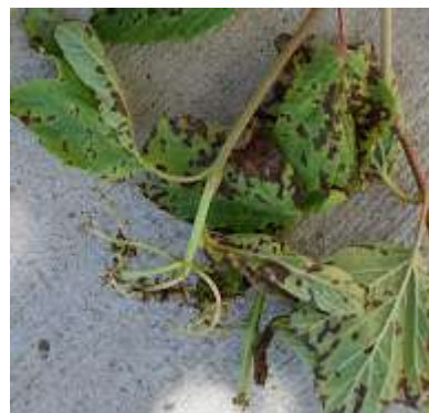
Figure 6. Manifestation of the causative agent of bacterial blight on the leaves of Viburnum sargentii

viburni ) could be noted, which was observed on the example of plants of Viburnum Serzhenta (Fig. 6).