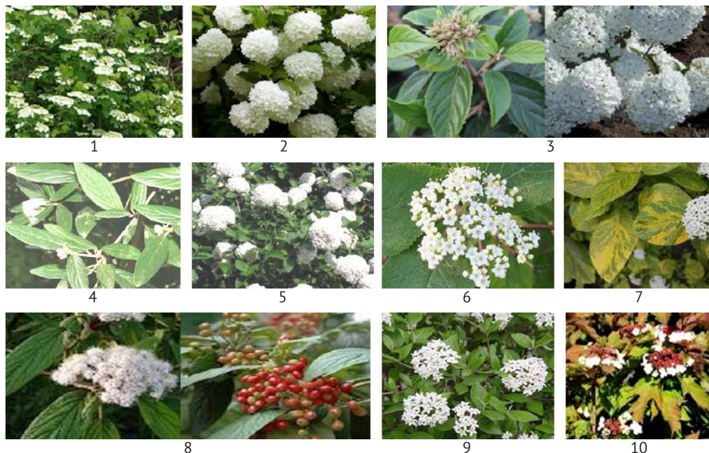
Figure 1. Photos of Viburnum samples involved in the study: 1 – Viburnum opulus L. Yaroslavna; 2 – Viburnum opulus Roseum; 3 – Viburnum opulus L. Eskimo; 4 – Viburnum rhytidophyllum Hemsl.; 5 – Viburnum × carlcephalum ; 6 – Viburnum lantana ; 7 – Viburnum lantana var. variegatum ; 8 – Viburnum × rhytidophylloides ; 9 – Viburnum × burkwoodii ; 10 – Viburnum sargentii Koehne

Accounting for damage to viburnum plants by bacterial leaf spotting was conducted at the experimental sites of the Institute of Horticulture of the National Academy of Agrarian Sciences of Ukraine (NAAS) and its research network during 2019-2021. Varieties/breeding forms of Viburnum ( Viburnum opulus L.) of Ukrainian selection were involved in the investigation of the degree of plant damage: Ania, Uliana, Yaroslavna, Elina, Omriyana, Sonetta, Horikhova, Osinnia, Kralachka, Plododekorna (co-authors of which are T.Z. Moskalets, V.V. Moskalets et al. ) and species of viburnum: Viburnum lantana ; Viburnum carlcephalum ; Viburnum rhytidophylloides ( Viburnum × rhytidophylloides ); Burkwood Viburnum; leatherleaf Viburnum ( Viburnum rhytidophyllum Hemsl.); Viburnum Roseum ( Viburnum opulus Roseum); Viburnum sargentii Onondaga ( Viburnum sargentii Koehne Onondaga); common dwarf Viburnum ( Viburnum opulus L.), Eskimo Viburnum (Fig. 1). Observations and records of plants were conducted during May-September (Methodology for examination of varieties..., 2016). Leaves of the examined varieties were collected twice during the growing season. During the growing season of Viburnum plants, 10-15 leaves were selected from 3 trees (bushes) of each variety/species (5 leaves x 3 repetitions).