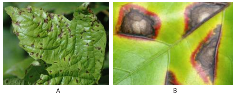
Figure 3. Manifestation of the causative agent of bacterial blight at the initial stage of the Pseudomonas syringae pv. viburni lesion on the leaves of Viburnum vulgare dwarf ( Viburnum opulus L.) Eskimo (A) and Viburnum Roseum ( Viburnum opulus Roseum) (B)