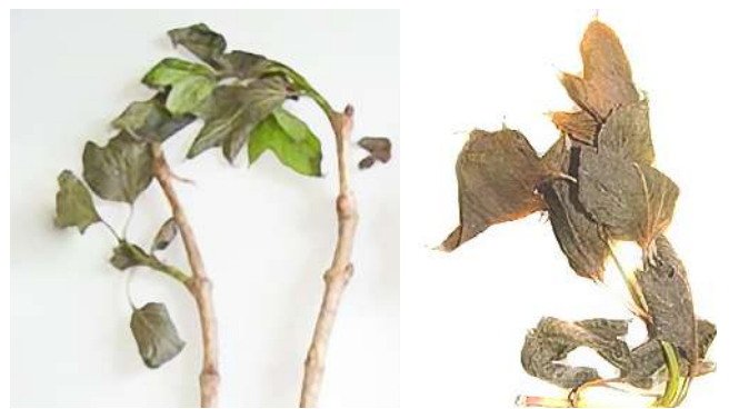
Figure 4. Manifestation of the causative agent of bacterial blight at the initial stage of the Pseudomonas syringae pv. viburni lesion on the leaves of twigs of Viburnum sargentii Onondaga variety ( Viburnum sargentii Koehne Onondaga)

On the surface of the leaves, a layer of bacterial secretions, which makes the leaves shiny, can be observed. If a bacterial blight occurs at the beginning of the growing season, the leaves may be distorted. In severe cases, the shoots may die off (Fig. 4).