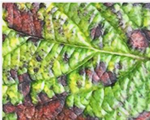
Figure 5. Manifestation of the causative agent of bacterial blight at the initial stage of the Pseudomonas syringae pv. viburni lesion on the leaves of Viburnum rhytidophylloides Surin

The greatest manifestation of bacterial blight was noted on plants of the Viburnum rhytidophylloides Surin species, which manifested itself in browning and premature leaf fall. Brown spots appeared on the upper, lower, or both surfaces of the leaves. In particular, the spots on the leaves were pointy or rounded, slightly raised or recessed, and had smooth or fringed edges. Therewith, the colours of the spots varied from yellow to yellow-green, orange-red to light brown, dark brown, or black with a halo of yellow tissue around each spot (Fig. 5).