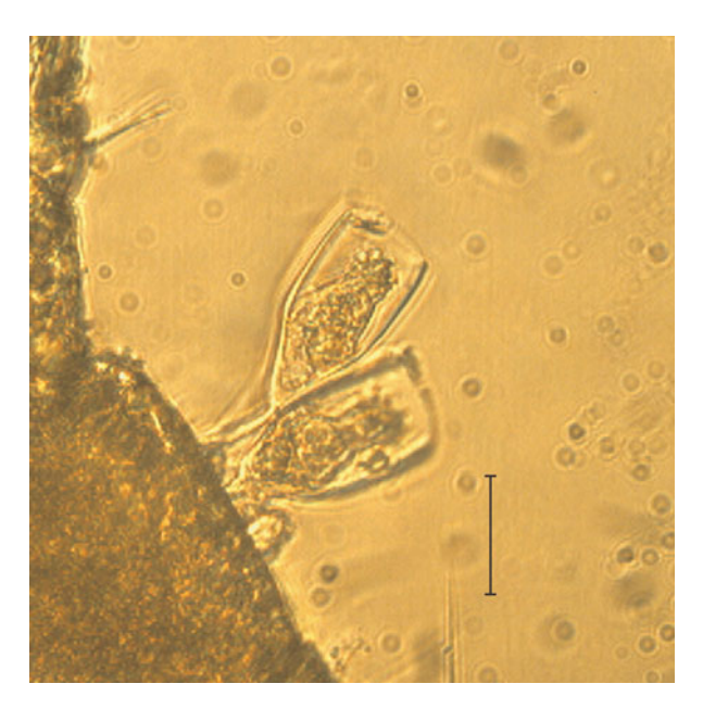
Fig. 2. Praethecacineta halacari attached to Copidognathus sp. from Taiwan. Scale bar 20 \mu m