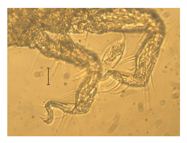
Fig. 3. Praethecacineta halacari attached to Copidognathus ungujaensis Chatterjee, De Troch & Chang from Zanzibar, Tanzania. Scale bar 20 \mu m.